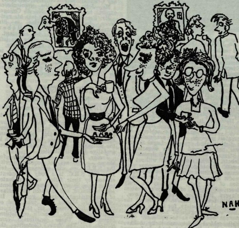
A group of Freshers at the reception.