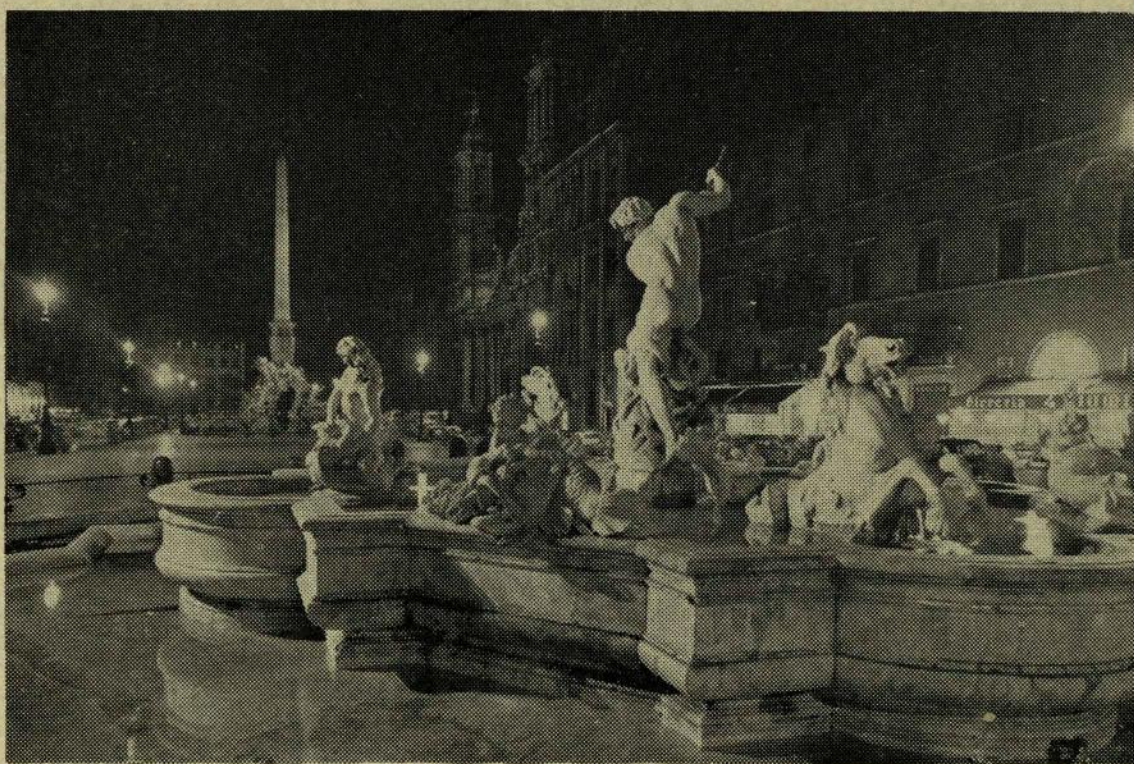
ROME: The Piazza Navona.

there is, especially in Northern Italy, a preponderance of well-fed, athletic Germans. As no one lives in the artificial vacuum of a hotel, the normal interplay between family and friends is preserved—sometimes with surprising results. Once,