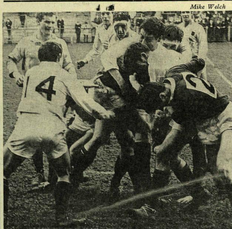
Trinity forwards in a loose maul against Wesley.